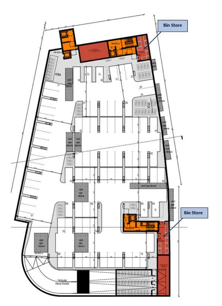
Figure 5.0 Waste Storage Block E & F

The proposed Waste Storage Areas are located in the basement level in Block E & F as per Figure 5.0. Residents will use the stairs/lift to access the basement level. It is recommended that all WSAs should have secure access with either key or fob to ensure only residents may place waste in the respective WSA in Block E & F.