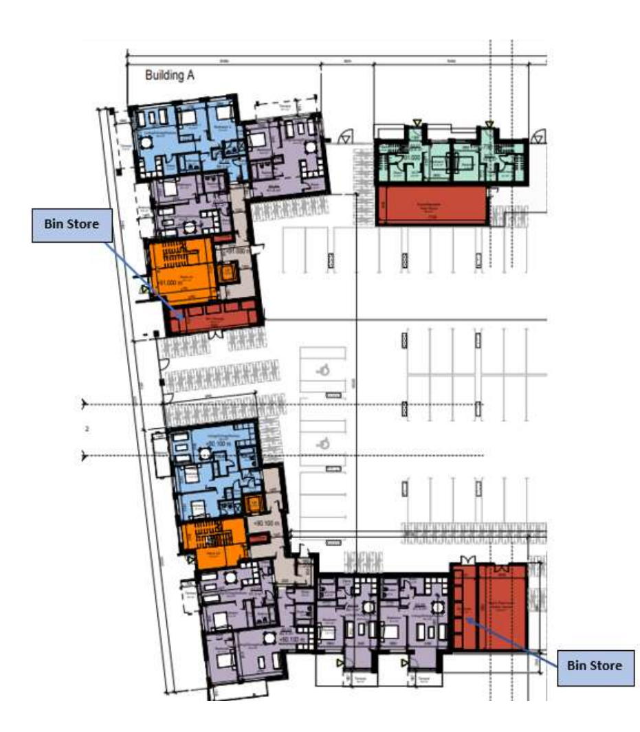
Figure 1.0 Waste Storage Area (Block A)

The proposed Waste Storage Areas for Block A are located on the northern and southern wing as per Figure 1.0. Each WSA is titled "Bin Store". It is recommended that all WSAs should have secure access with either key or fob to ensure only residents may place waste in the respective WSA in Block A.