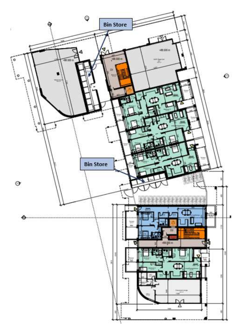
Figure 4.0 Waste Storage Block D

The proposed Waste Storage Areas are located as per Figure 4.0. It is recommended that all WSAs should have secure access with either key or fob to ensure only residents may place waste in the respective WSA in Block D. It is recommended that all WSAs should have secure access with either key or fob to ensure only residents may place waste in the respective WSA in Block D.