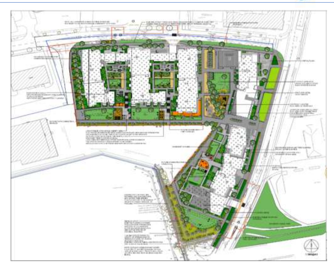
Figure No. 1 Site Layout