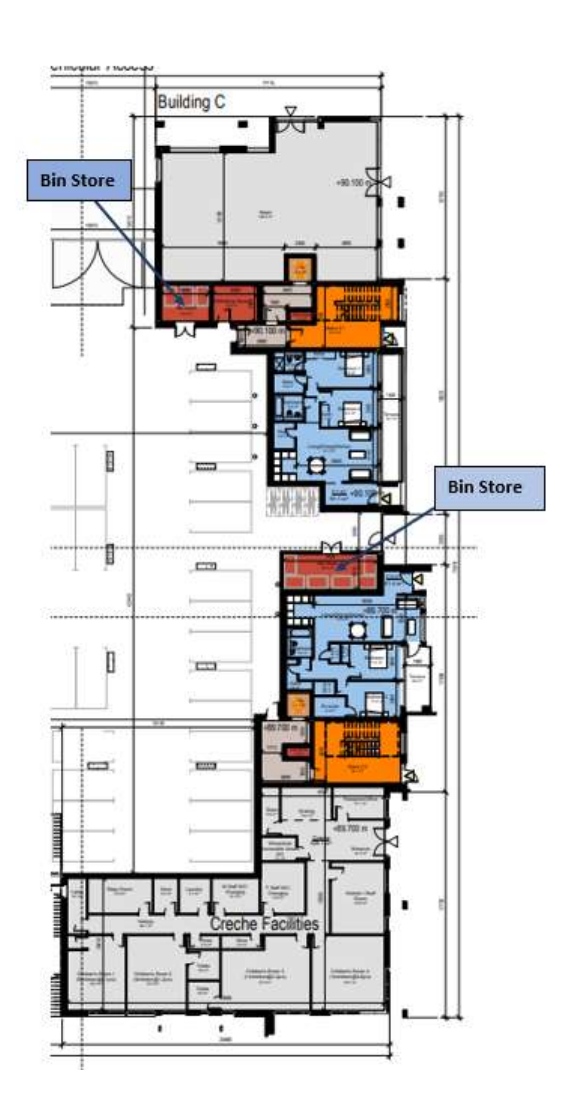
Figure 3.0 Waste Storage Block C

The proposed Waste Storage Area is located as per Figure 3.0. It is recommended that all WSA should have secure access with either key or fob to ensure only residents may place waste in the respective WSA in Block C.